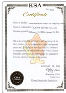
Obtained an award from the Korean Standards Association