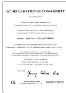
EC Declaration Conformity