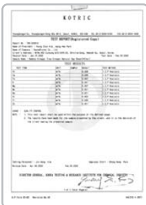
Anion Test Result