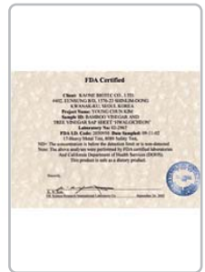
Passed the safety test of FDA