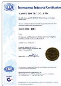
Obtained ISO 14001