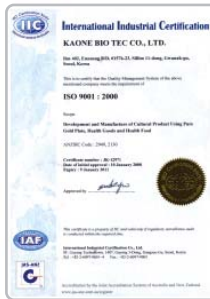
Obtained the international standard ISO 9001