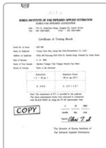
KOTRIC Test Result