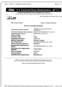
Far Infrared Ray Test Result